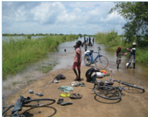
Children can make the best of the worst of times

"They risk everything to save what they have," Zucula commented, adding that the government had started positioning uniformed police officers in flooded areas to send people back and to reassure those who were afraid their possessions would be looted.