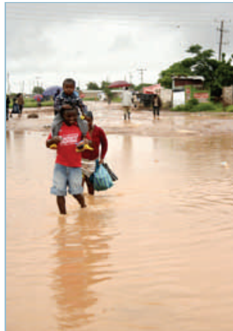
Wading to the shops

cooler water wells up to the surface of the eastern Pacific Ocean, an event strongly associated with heavy rainfall across southern Africa.