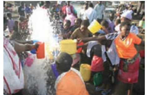
Collecting water in a Nairobi slum