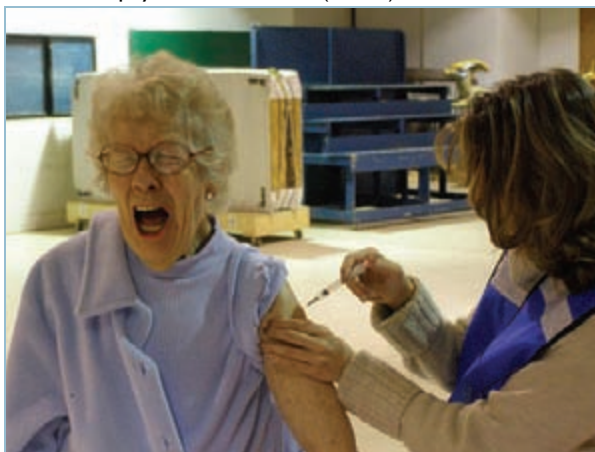
And she used to tell her kids that it was just a little prick!!

Bresee said the CDC is watching the oseltamivir-resistant viruses very closely and that investigators still don't know what caused the mutation. #