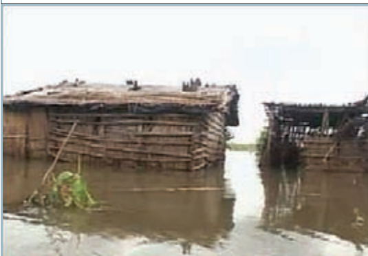
Not only water—there are crocodiles in there too

Three issues were essential in getting people to stay in relocation areas, Mclvor said: infrastructure - including education, health centres, water and sanitation; a means of making a living, and their willing consent. Mclvor noted that some communities had become dependent on aid and opted to stay in flood-prone areas because they knew that government aid agencies would come to their rescue if the rivers burst their banks, but asked, "What is the longer-term strategy?" This would need to be explored, and a long-term solution identified. #