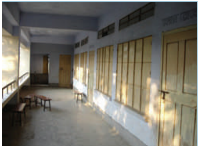
Iron shutters protected against the 220kph winds outside