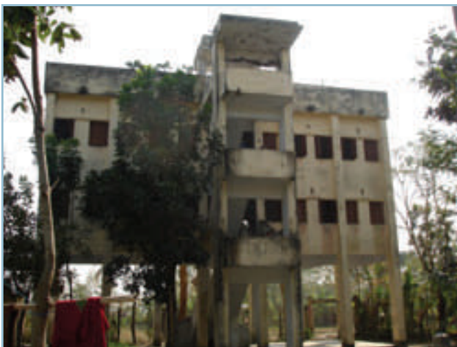
Elevated on pillars, the shelters are designed to withstand major cyclonic tidal surges