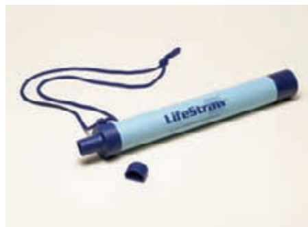
The original LifeStraw

IMA began distributing LifeStraws on an acceptance test basis in the eastern Democratic Republic of Congo (DRC), where cholera is endemic, with a consignment of 250 in 2005, reporting that 95 percent of recipients said they liked them and hoped they would become available. IMA is now scaling up its activities with LifeStraw.