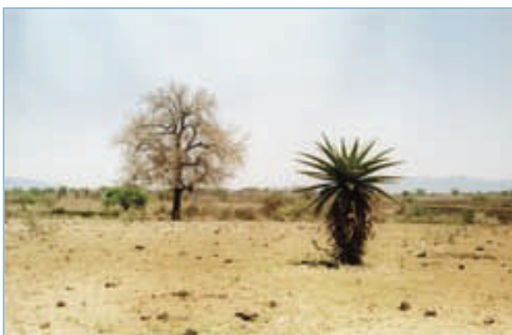
Once fertile land turned barren - climate change the culprit say experts

Dominia affected up to two-thirds of Swaziland's declining population of less than a million. After that, "the worst storm in 20 years hit the country in January 2005, affecting about 100,000 people, causing widespread damage and killing about 30 people," Makanza said.